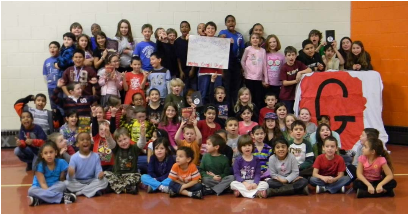
This year's Gryffindor students celebrate their win of the House Cup Challenge held during Harry Potter week.

Metro Credit Union is located at 1124 Worcester Rd., Framingham, MA 01702.